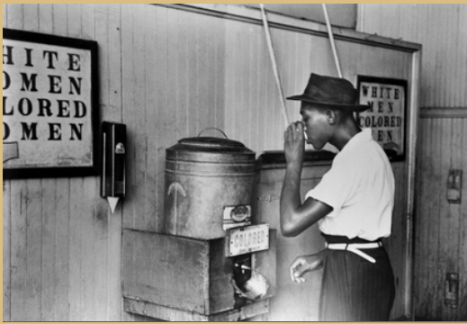
Black Codes and Jim Crow Laws, National Geographic