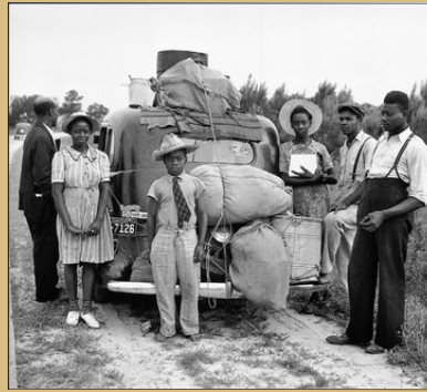
The Great Migration