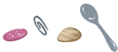
Various small items, like: button, paper clip, rock, spoon