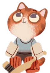
• GILLES •