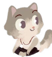
• CHARLOTTE •