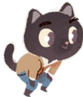
• GENEVIEVE •

IN THE SPACE BELOW, IMAGINE WHAT YOU WOULD LOOK LIKE AS ONE OF THE YOUNG CATS IN LET'S GET SLEEPY!