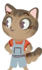
• MADELINE •