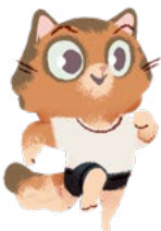
• MAURICE •