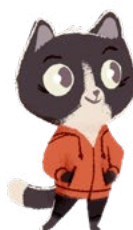
• SANDRINE •