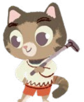
• PATRIC •