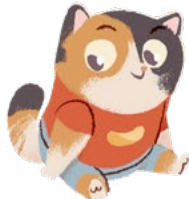
• CHIP •