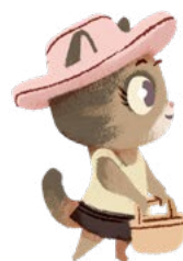
• CLOTILDE •