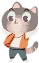
• GUILLAUME •